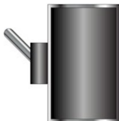
"PARKING" LIGHTS ONLY