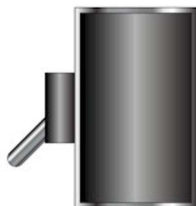
"PARKING" LIGHTS AND HEADLIGHTS